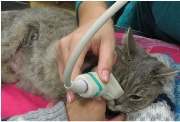
Figure 1. Examination technique in a non-anaesthetised cat. Transducer was positioned in the horizontal plane, with the long axis of the transducer held parallel with the line connecting the medial and lateral canthus. The marker point is pointing nasally